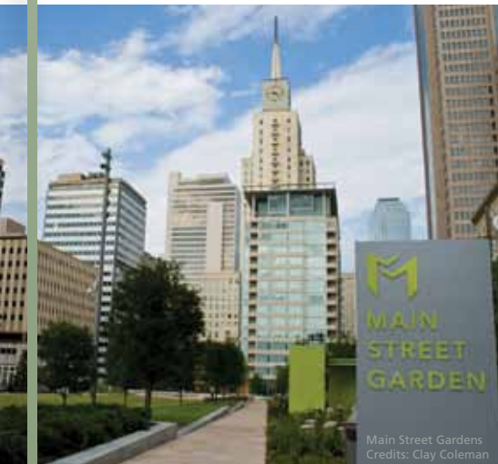
Main Street Gardens

Register by August 26, 2011 and save $50! Business Law and Corporate Counsel section members can save $75!